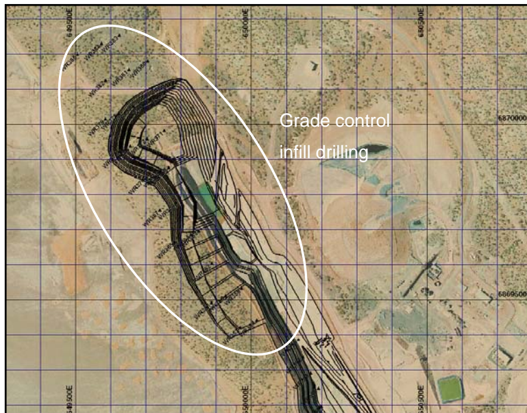
Start-up pit design (cutback of historic pit) with grade control drilling