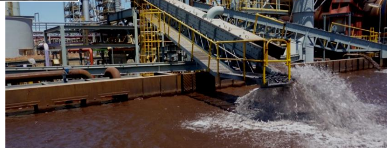
Roasted magnetite concentrate from the rotary kiln undergoing leaching in vats