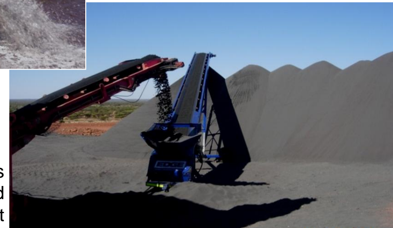
Existing calcined iron fines undergoing screening and stockpiling for shipment