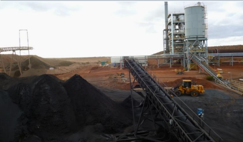
Stockpiled magnetite concentrate being fed into the kiln