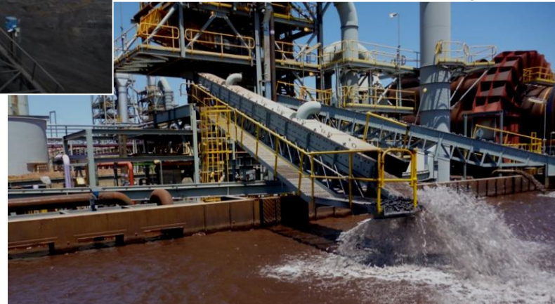
Roasted magnetite concentrate from the rotary kiln undergoing leaching in vats